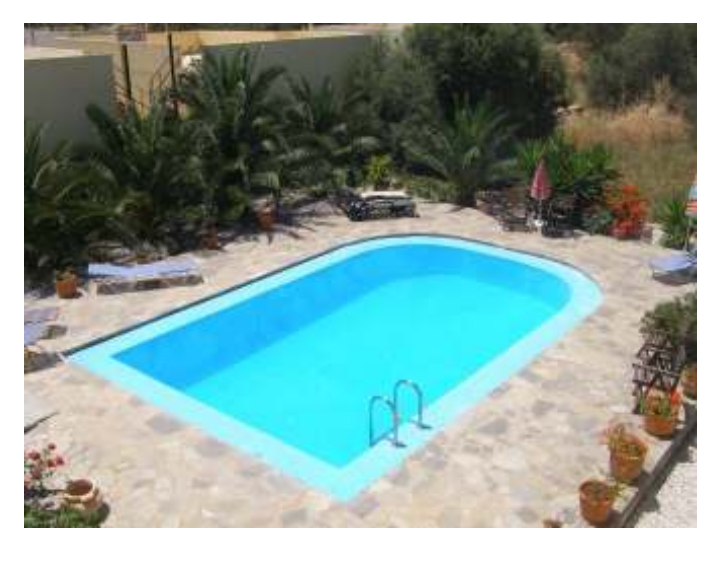
`a perfect holiday home from home'